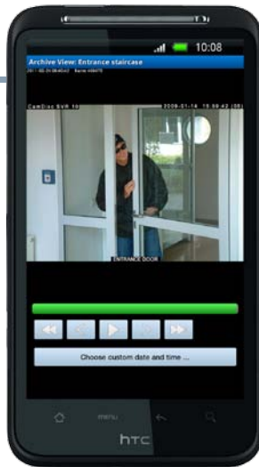
Access dialogue continuous recording

After connecting to a HeiTel VideoGateway the display will show live video images. The image quality can be adjusted in four levels and consequently the frame rate can be raised. After selecting a PTZ camera the pan-tilt function of PTZ systems as well as the zoom can be controlled using the display. Actually the displayed arrows are not visible, but they indicate the screen area which can be minimised or enlarged with Swipe Gestures. The relay control is generally active if the relay has been set up as a switch or button.