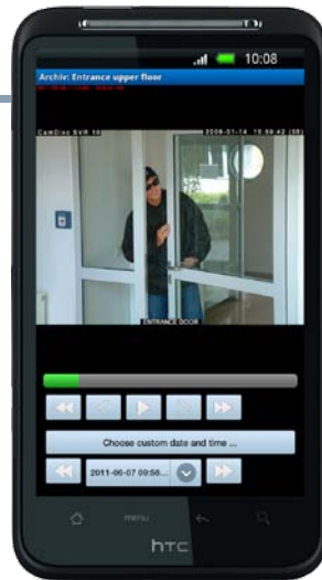
Access dialogue event recording