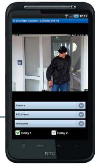
Live video transmission with camera and relay control