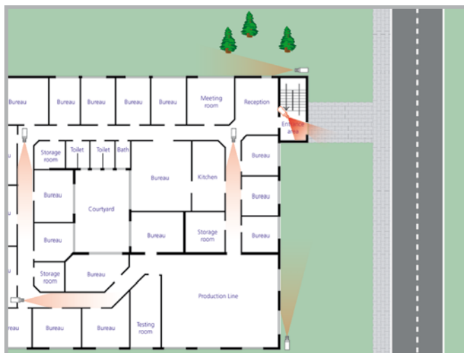
4th Level: Detailed floor plan of the building